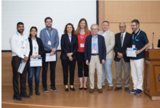
The team of WCTRS-Y 2019

In addition, valuable insights for upcoming editions could potentially be gathered from the audience. Although organizers received informally positive feedbacks from several participants, their satisfaction and inputs could also be assessed more systematically for instance by means of a short survey .