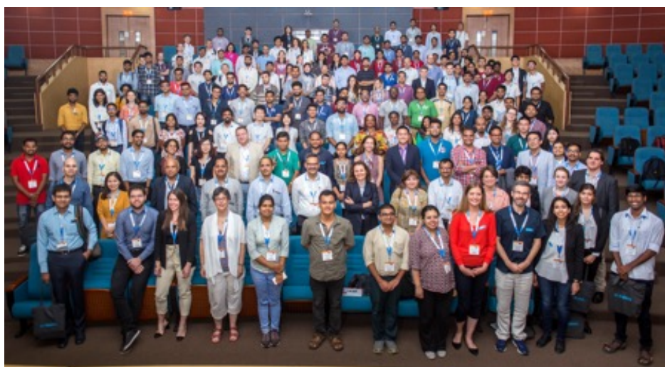
Group picture of the WCTRS-Y conference

The WCTRS-Y conference was held on Sunday, May 26, 2019, at the Indian Institute of Technology Bombay in Prof. B. Nag Auditorium. Around 200 persons attended the conference with a peak of attendance estimated at about 170 persons at the same time. Although the event was targeted at young researchers, it was also well attended by more experienced researchers.