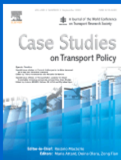
Case Studies in Transport Policy