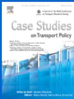
Case Studies in Transport Policy