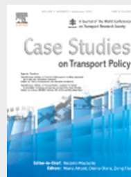
Case Studies in Transport Policy

WCTRS book series - For details, visit: link