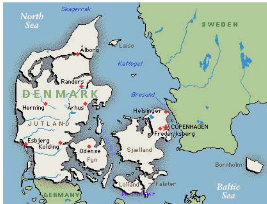
Figure 1: The location of the Great Belt and Oresund. The Great Belt link opened for rail traffic in 1997 and for road traffic in 1998. The Oresund link opened for both rail and road traffic in 2000.

Previous studies on the logistical effects of the fixed links across the Great Belt and Oresund have mainly focused upon impacts on manufacturing and service related firms or surveys of industrial sectors (Füssel, Skjøtt-Larsen, 1990; Björnland, 1997; The Great Belt, 1999). In the present study, the intention has been to look at specific examples of firm's and also to include the outermost link in the logistical chain – the transport firms.