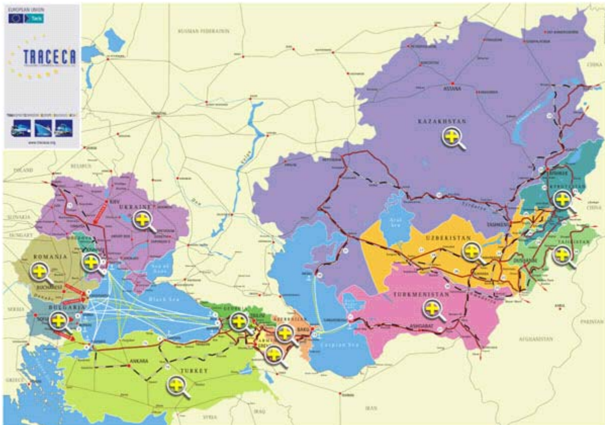
Figure 2. Map of Traceca ( www.traceca.org.tr )