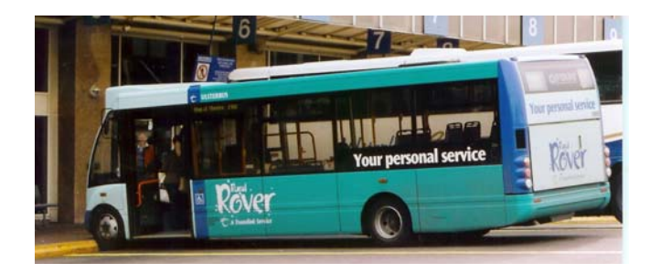
Figure 1: The 'Rural Rover' is Northern Ireland's first flexible demand responsive bus service and is made possible through cross-subsidy and the Rural Transport Fund.

In September 2002, the Department for Regional Development (DRDNI) published a consultation paper on the future of public transport in the province which reinforced the argument for competitive tendering on the basis of targets set out in the Regional Development and Transportation Strategies. The key element of this consultation is the plan to "through time, and in a manner that is publicly acceptable and financially feasible, the public transport market would be opened up to private sector participation as a way of better exposing it to market forces, improving quality and efficiency, increasing attention to customer requirements and reducing the cost of service provision where practicable". (RDS for NI, 2001).