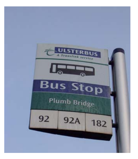
Figure 2: RTF 'easy to read bus stop flag in Plumbridge, a rural village in County Tyrone.

Much policy provision is made in the RDS and RTS for the increased development of the Northern Ireland Rural Transport Fund. The fund was set up in 1998 to provide subsidy