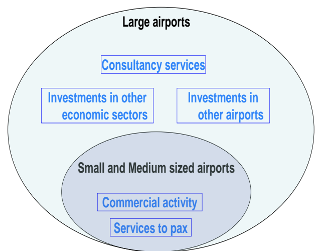
Figure 2: Strategies of diversification by airport size