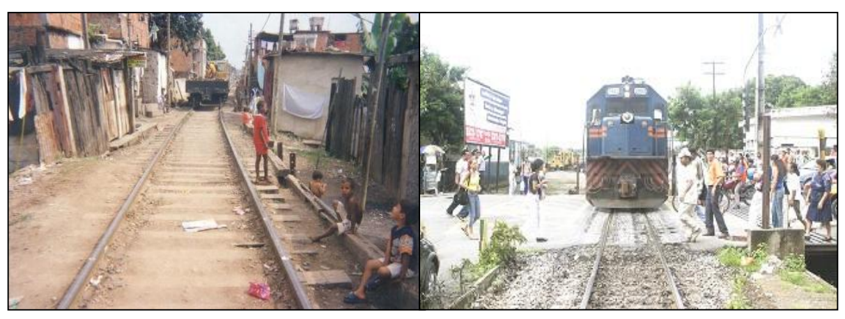
Figure 2 - Example of an Invasion of the Right-of-way and a Critical Level Crossing

6. Expansion of the railway network integrating countries and the transport infrastructure, as the New Transnordestina (construction of 880 km and remodeling of 1,180 km), the Construction of Alto Araguaia–Rondonópolis section (236km) and others (Lang, 2007).