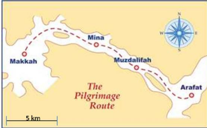
Figure 2: Hajjis route