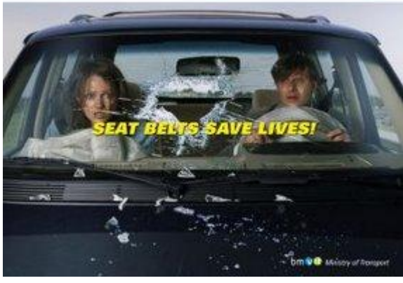
Figure 5. Austrian media campaign on the use of safety belts in rear seats [44]

Again, as an example, the analysis of different accidents in motorways shows that on one hand users do not always have a correct perception of the risks to which they are exposed and that some features of the individual character and some personal specific situations could lead users to underestimate or overstate the risk (Brunel, 2002).