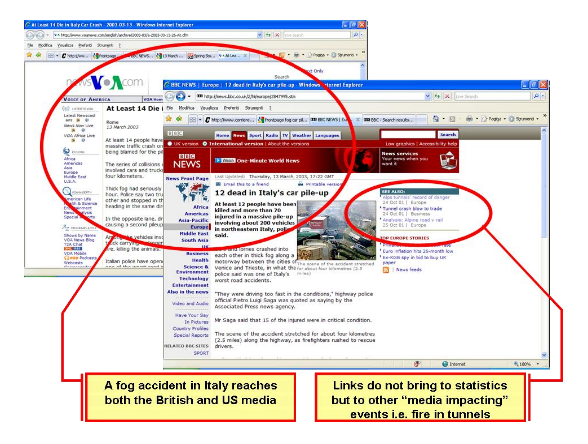
Figure 4. Crashes with car pile-up are events shaking media.