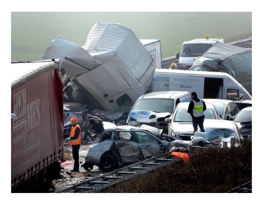
Figure 3. Resulting pile-up from crash happened on A21<sup>5</sup> motorway, February 22<sup>nd</sup> 2008

It can be observed that the media attention and exposure is not necessarily related to statistics and the attention not necessarily addressed to events similar in happening but sometimes the attention is driven to events similar in media impact. See figure 4, where a media impacting event for fog bring the journalist to link to fire in tunnel events (the BBC news on fog crash of March 13<sup>th</sup>, 2003 links to some news of October 24<sup>th</sup>, 2001 related to the fire accident on the Swiss tunnel of St . Gotthard).