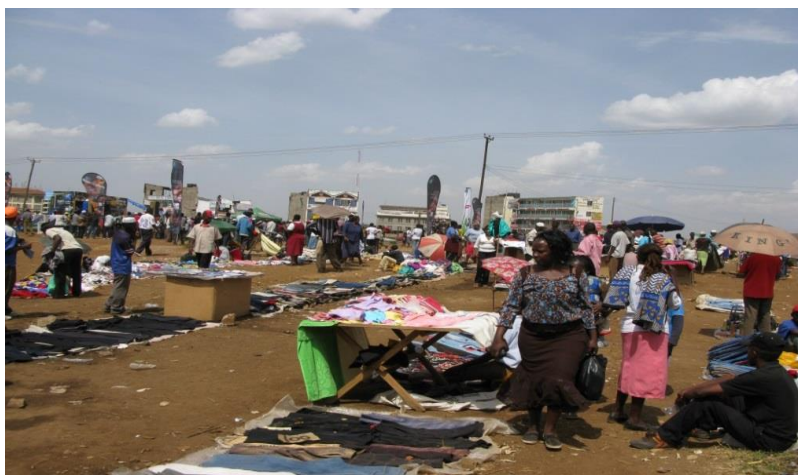
Figure 1. A road side market in Nairobi, where both the traders and their customers are exposed to air pollution from the traffic.

Air pollution can be attributed to not only particulate matter, but also to gaseous pollutants. In countries where air quality has been monitored for long times, a set of criteria pollutants are monitored on a regular basis, Table I. These pollutants have a long record of influencing health and some also effect vegetation and built structures.