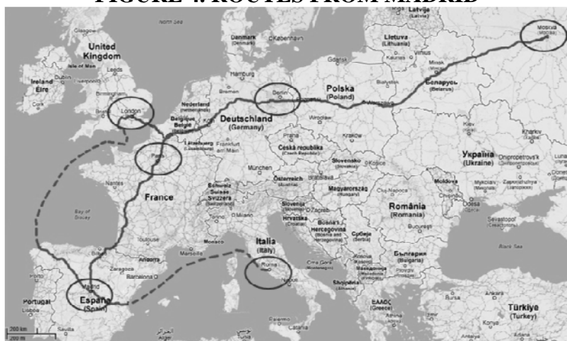
FIGURE 4. ROUTES FROM MADRID

over the average EU-27 10 , Barcelona is definitely different from Madrid in terms of geographical situation.