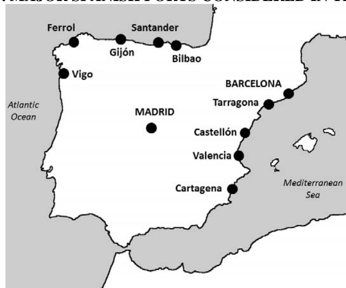
FIGURE 3. MAJOR SPANISH PORTS CONSIDERED IN THIS STUDY