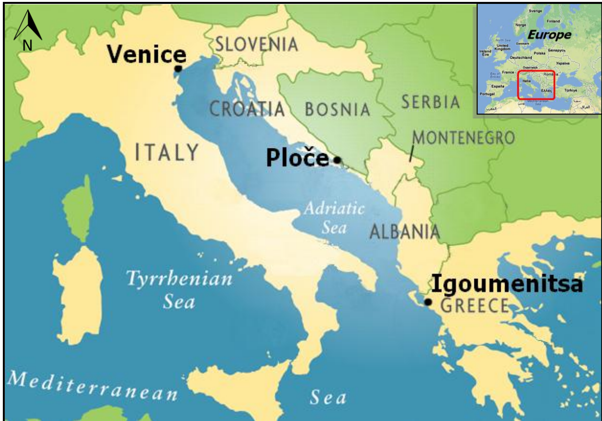
Figure 2 - Location of the APC ports

Ravenna, Koper, Rijeka, Split, Ploče and Bar operate in this region, serving significant cargo and passengers flows. In its southernmost part, the Adriatic Sea outflows to the Ionian Sea allowing connection to the Greek ports of Igoumenitsa and Patras.